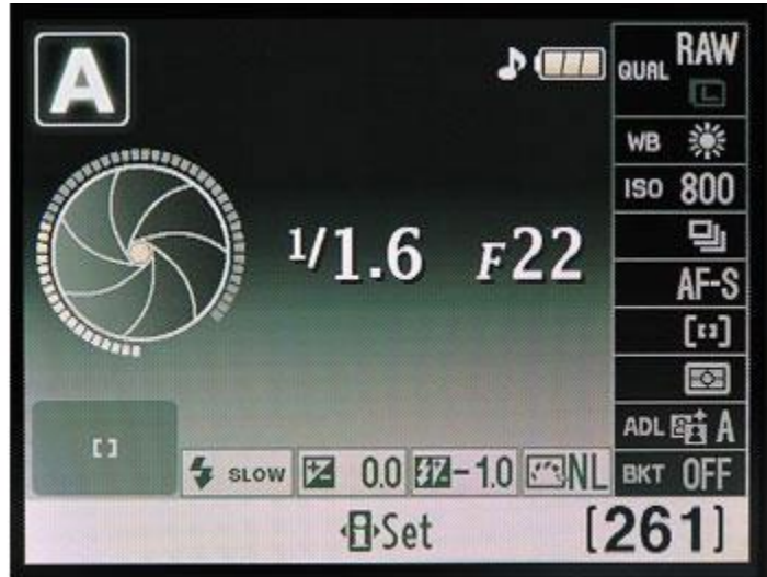
High f/stop - Small aperture - Greater depth of field