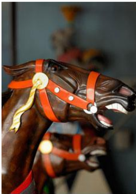
Aperture set at f/2.8 - Less depth of field

The higher the f/stop—the smaller the opening in the lens—the greater the depth of field —the sharper the background.