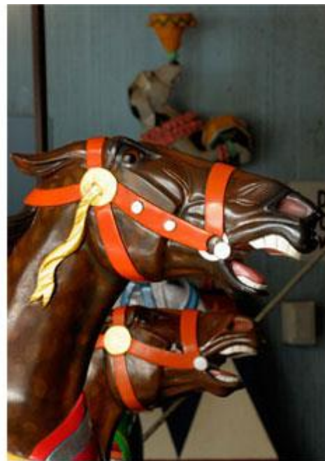
Aperture set at f/11 - Greater depth of field